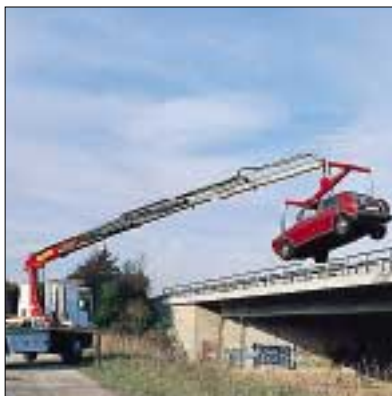
PK 8000 T/14500 T