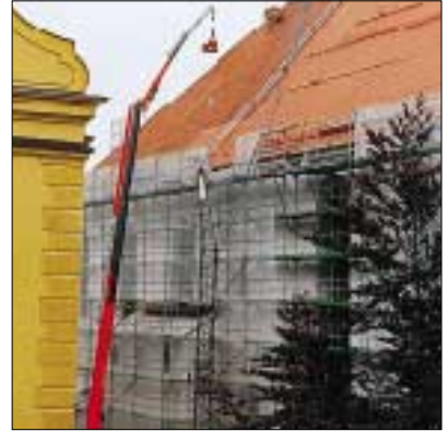
PK 680 TK