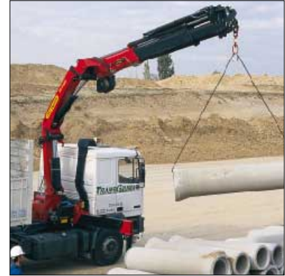
PK 24500/24001 USA