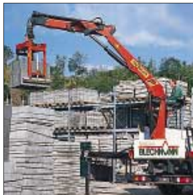
PK 13000 L