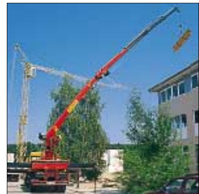
PK 30000 EL/33000 EL