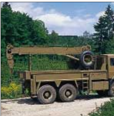
PK 31000 TW