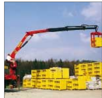
PK 19000 L