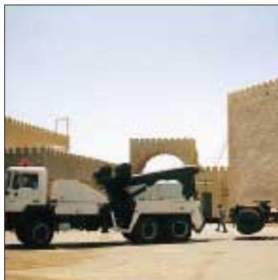
PK 55000 T