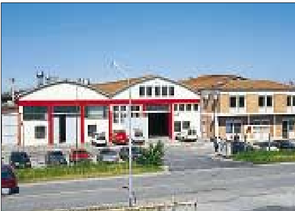
Cadelbosco di Sopra