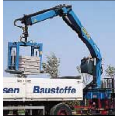
PK 16000 L